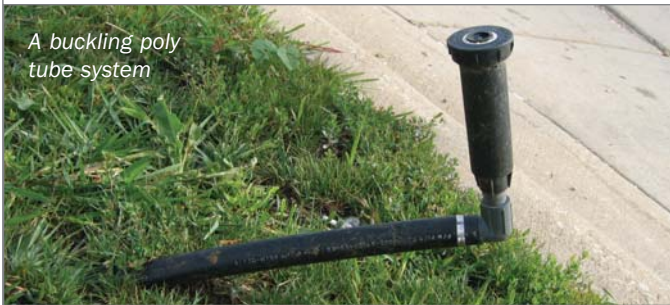
A buckling poly tube system

PVC pipe typically lasts up to 50 years or more. Plus, because they come straight, there's no chance for buckling after installation. Polyethylene systems can begin deteriorating within a relatively short period of time. And because it comes on rolls, it can begin to roll-up again. When this occurs, sprinkler heads get displaced – watering areas you never intended.