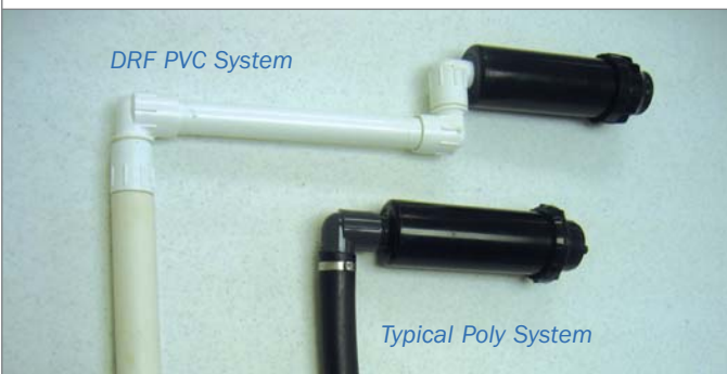
DRF PVC System